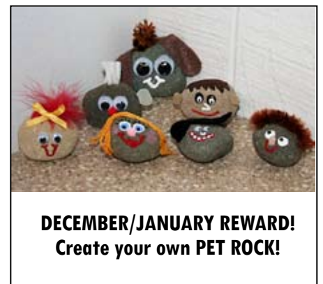
DECEMBER/JANUARY REWARD! Create your own PET ROCK!