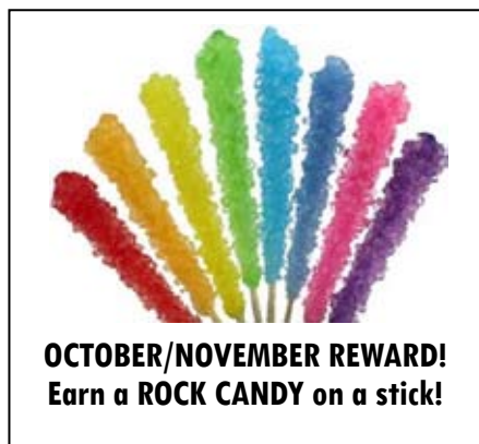
OCTOBER/NOVEMBER REWARD! Earn a ROCK CANDY on a stick!