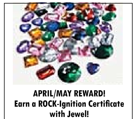
APRIL/MAY REWARD! Earn a ROCK-Ignition Certificate with Jewel!